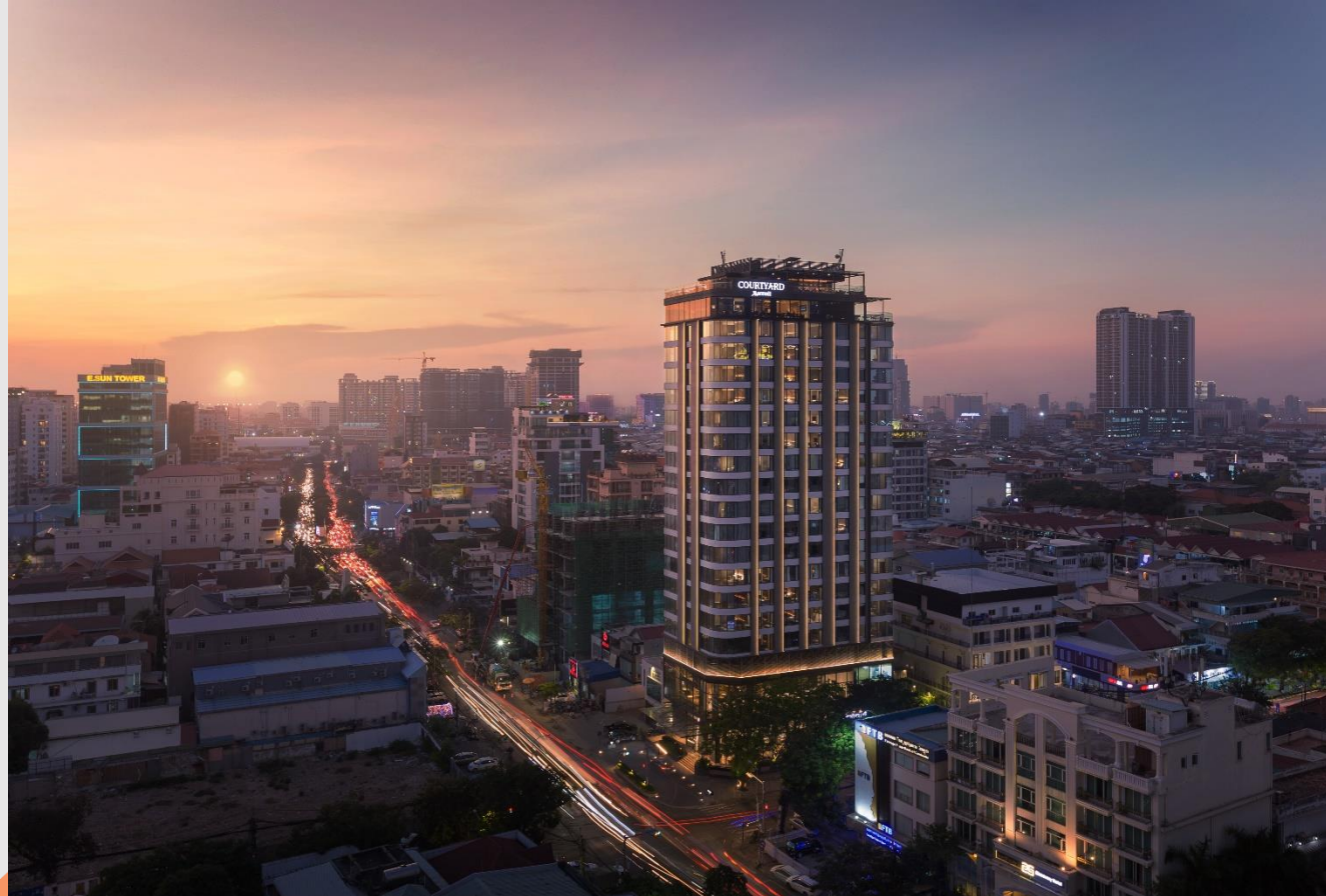
COURTYARD BY MARRIOTT PHNOM PENH